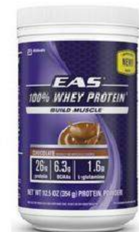
ABBOTT NUTRITION 100% Whey Protein Powder