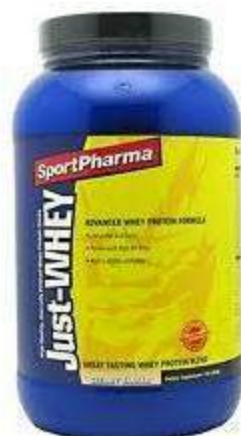
SPORT PHARMA Just Whey

10, Indraprastha, 1-C, Raheja Township, Jitendra Road, Malad (E), Mumbai - 400097