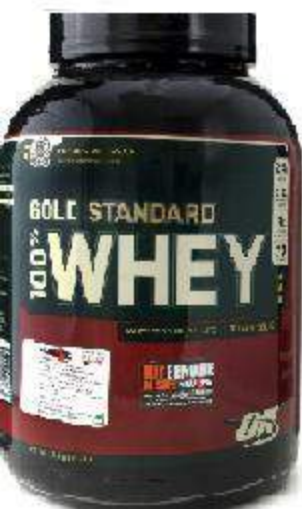
ON GOLD STANDARD 100% Whey Protein

ACE-K in Protein Shakes by World Leading Brands