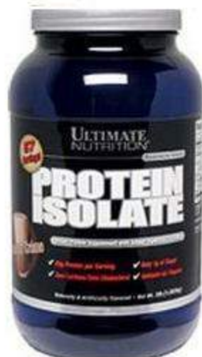
ULTIMATE NUTRITION Protein Isolate