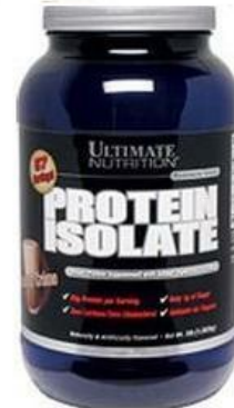
ULTIMATE NUTRITION Protein Isolate