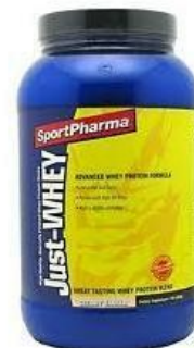
SPORT PHARMA Just Whey

10, Indraprastha, 1-C, Raheja Township, Jitendra Road, Malad (E), Mumbai – 400097 Ph : 022 – 65704186 / 28778563 Mob : 09702968181 E- mail : bimalpha@mtnl.net.in /