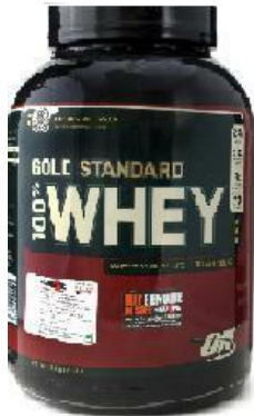
ON GOLD STANDARD 100% Whey Protein