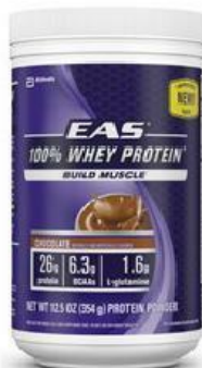
ABBOTT NUTRITION 100% Whey Protein Powder