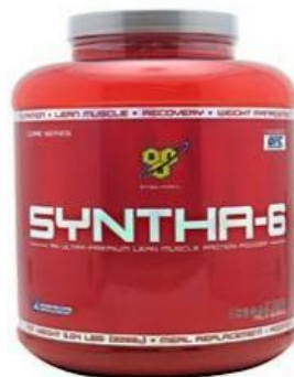
BSN SYNTHA -6 Protein Powder