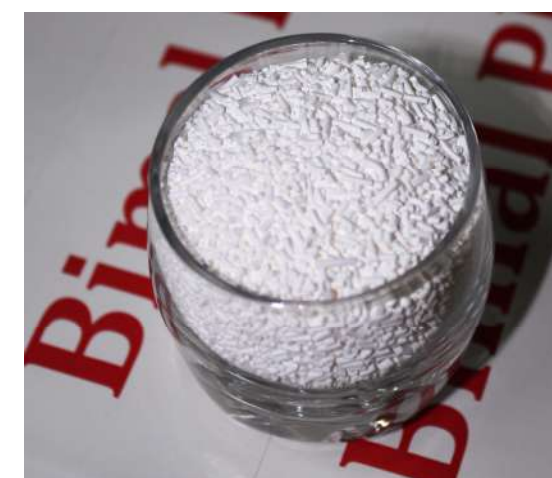
Potassium Sorbate, Granular