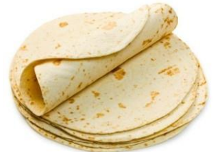
Semi Cooked Roti

Store in the Airtight & Dark Place at below 10°C in Original Packs.