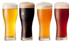
Non Alcoholic Beverages