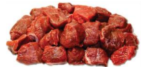
Cooked Red Meat