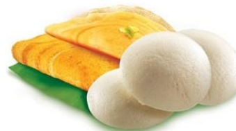
Idli & Dosa Batter